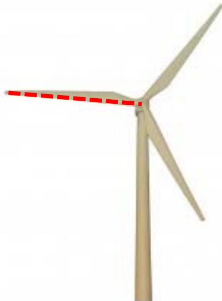
Figure 8: Lightning protection conductor inside wind turbine blade (in red)

The most important part to test is the conductor inside the blade. This measurement is taken between the blade's tip and the blade's root (see figure 8). This conductor is placed under significant strain as the blade flexes with the wind. Under strain, the conductor may fracture. Unfortunately, it is not enough to simply check continuity, because if the fractured conductor is touching at the break point during a continuity test, it will still pass. A current of 1 Ampere or more is recommended for this test.