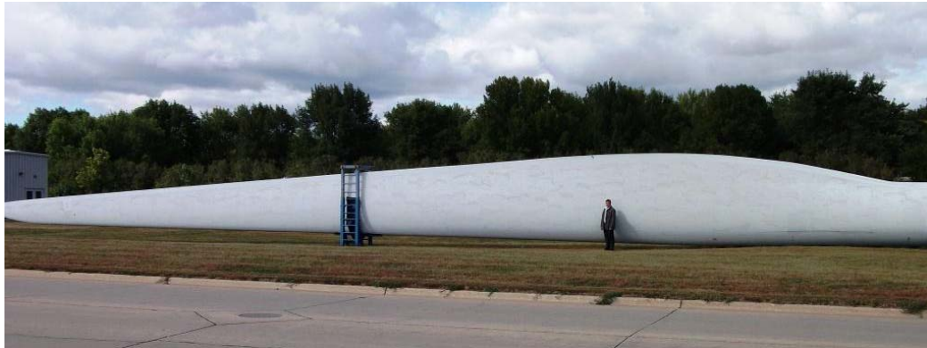
Figure 11: Turbine blade laid down at ground level

The length of a turbine blade can be seen in figure 11. The size of the turbines pose a problem, because low resistance ohmmeter test leads are typically very short. Due to the size of the wind turbines, some extra-long leads are required, often up to 100m.