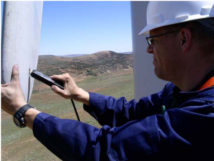
Figure 10: Connection at blade's tip