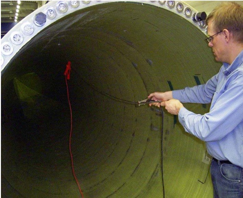
Figure 9: Connection at blade's root