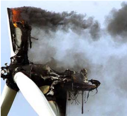
Figure 4: Catastrophic failure of a wind turbine due to a lightning strike