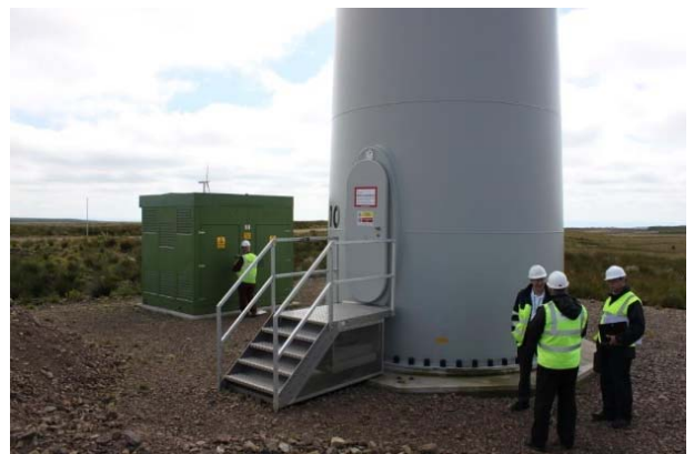
Figure 6: Turbine base