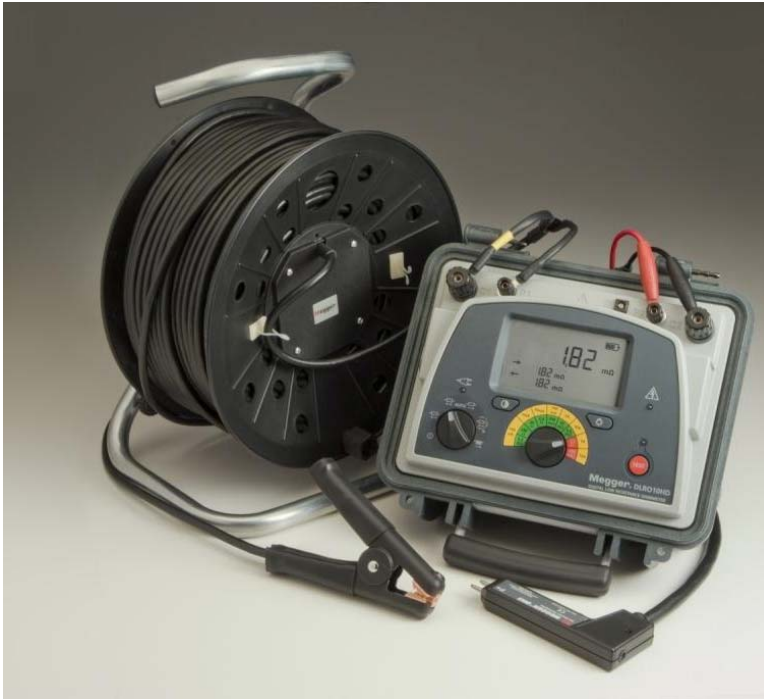
Figure 12: DLRO10HD with a set of KC test leads

Benefits of the DLRO10HD and KC test leads: