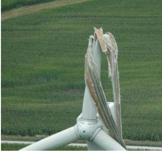
Figure 2: Turbine blade damaged by a lightning strike

It is hoped that this will prevent the damage shown in figures 2, 3 and 4.