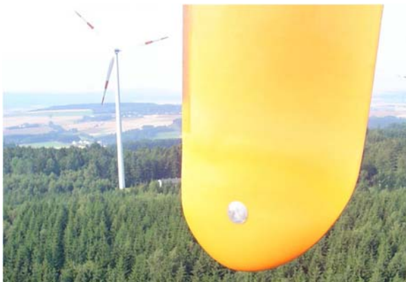
Figure 5: Blade tip

The protection takes the form of a low resistance path to ground. The path goes from the blade's tip (figure 5) to the base of the turbine (figure 6). This path is shown in figure 7.