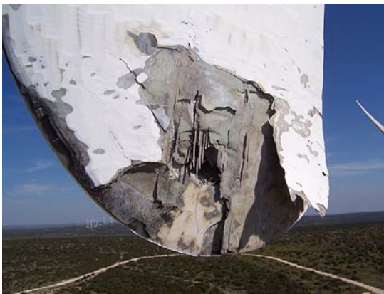
Figure 3: Entry point at tip of turbine blade from a lightning strike