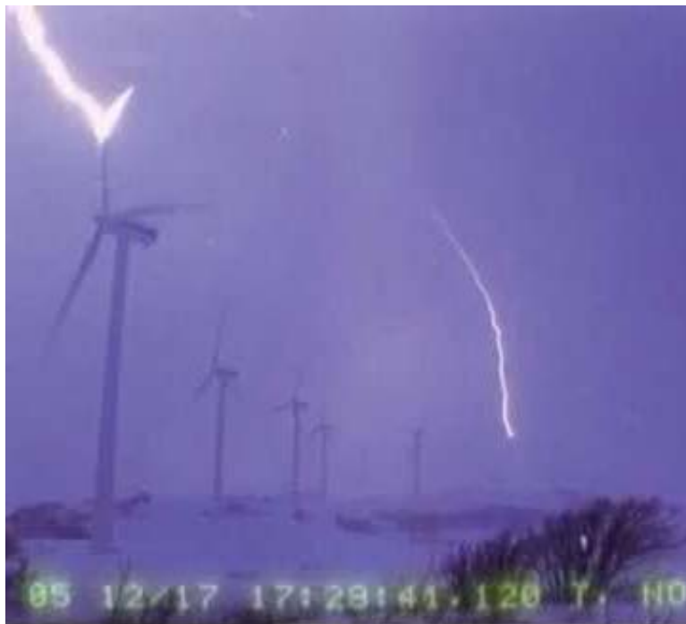
Figure 1: Lightning hitting wind turbines during a storm

A German study found that 80% of wind turbine insurance claims paying out for damage compensation were caused by lightning strikes.